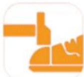
200 JOULE TOECAP