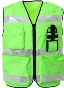
Reflective Safety Vest