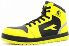
Safety Work Shoes