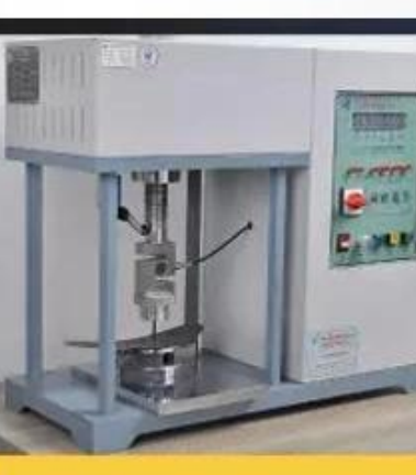
Midsole Test≥1200 Newtons