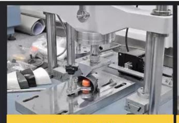
Toecap Test≥200 Joules