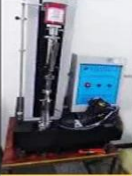
Bondness Test ≥4.0N/mm