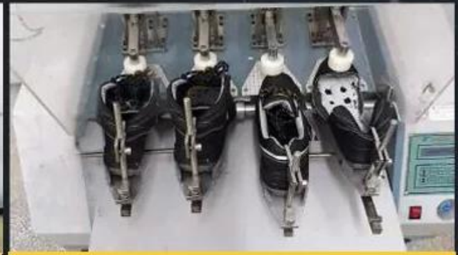
Flex Tester ≥ 36,000T