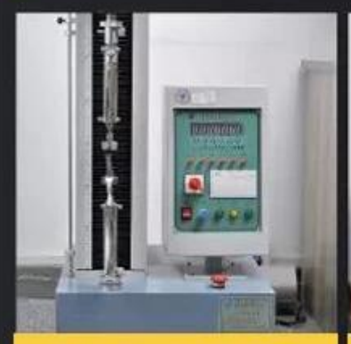
Tear Strength ≥120N