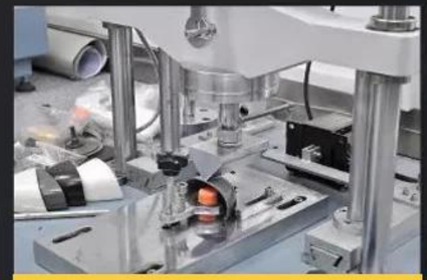
Toecap Test≥200 Joules