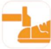
200 JOULE TOECAP