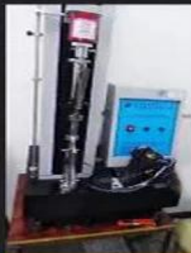
Bondness Test \geq 4.0 N/mm