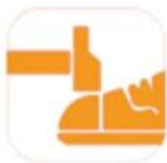
200 JOULE TOECAP