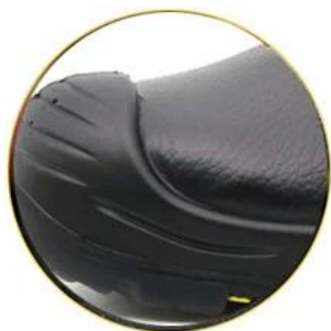
Waterproof cow leather upper

Removable metatomeal HI-POLY footbed provides long-lasting underfoot support and comfort.