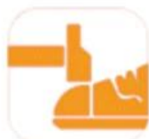
200 JOULE TOECAP