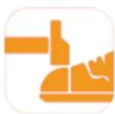
200 JOULE TOECAP