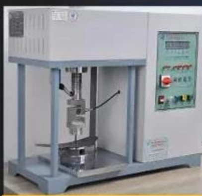
Midsole Test≥1200 Newtons