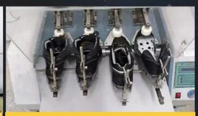
Flex Tester ≥ 36,000T