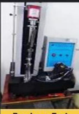
Bondness Test ≥4.0N/mm