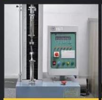
Tear Strength ≥120N