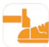
200 JOULE TOECAP