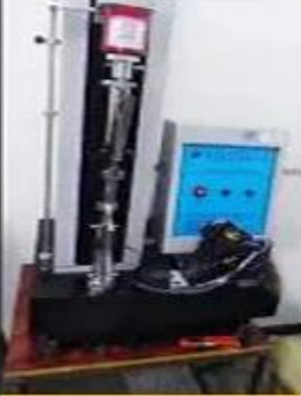
Bondness Test ≥4.0N/mm