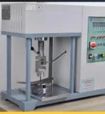
Midsole Test≥1200 Newtons