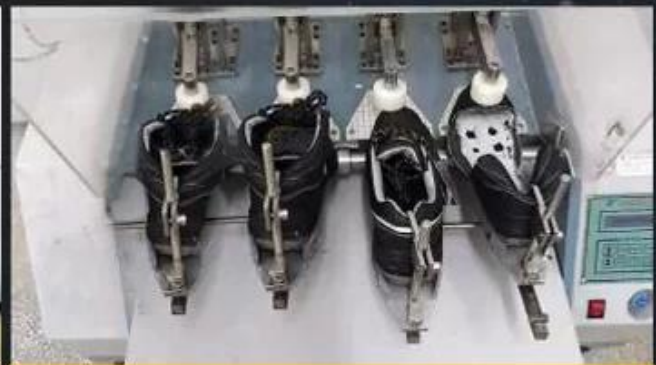
Flex Tester \geq 36,000 T