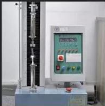
Tear Strength \geq 120 N