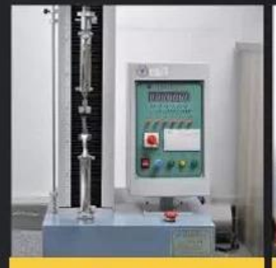
Tear Strength ≥120N