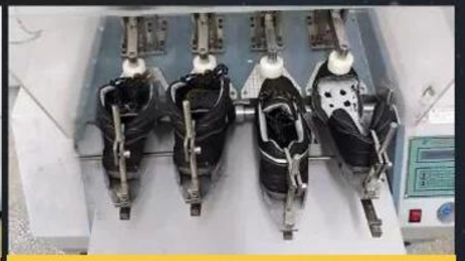
Flex Tester ≥ 36,000T