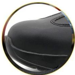
Waterproof leather upper

Removable metatological HI-POLY footbed provides long-lasting underfoot support and comfort.