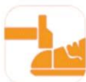
200 JOULE TOECAP