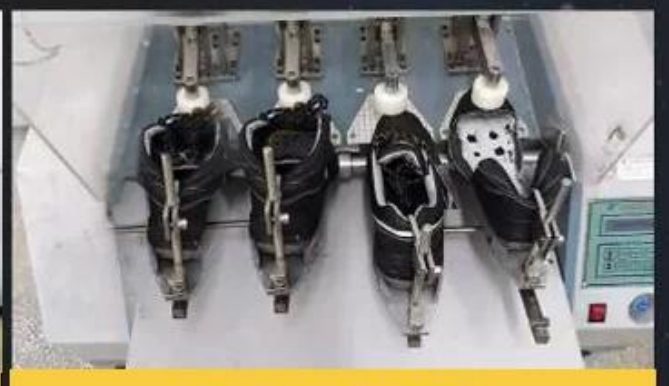
Flex Tester ≥ 36,000T