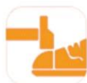
200 JOULE TOECAP