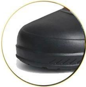
Waterproof EVA Upper

Removable metatomical EVA footbed provides long-lasting underfoot support and comfort.