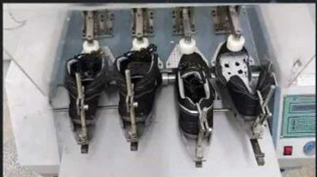
Flex Tester \geq 36,000 T