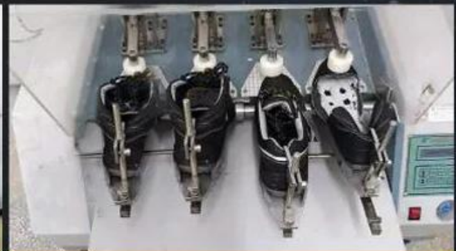
Flex Tester \geq 36,000 T