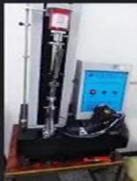
Bondness Test \geq 4.0 N/mm