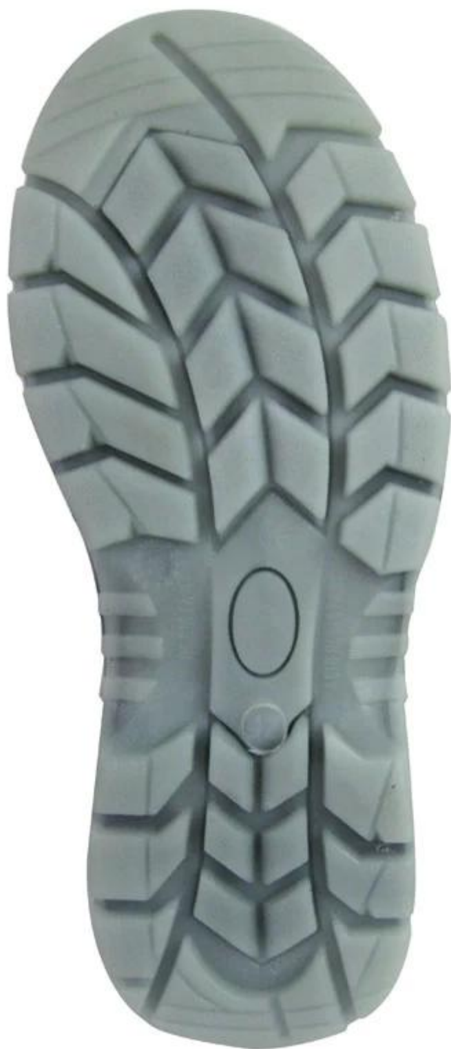
Safety shoes sole model show: