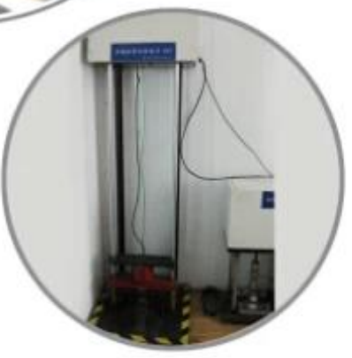
Impact Resistant Testing Machine