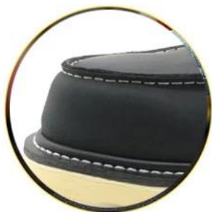
Waterproof leather upper

Removable metatological HI-POLY footbed provides long-lasting underfoot support and comfort.